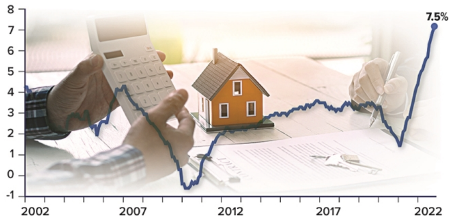
12-month change in shelter costs (CPI-U)